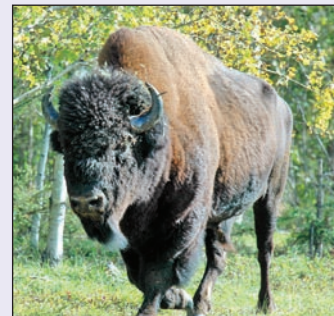
wood bison (buffalo)

The park is very important to people in the area. Tourists visit the area too. They like to fish, camp and go canoeing.