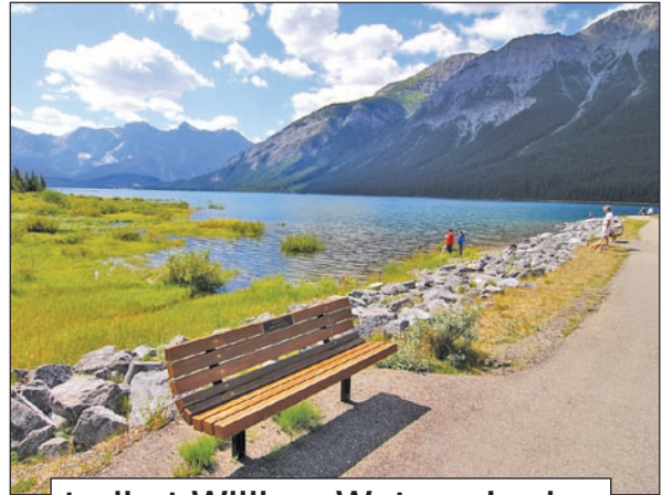
trail at William Watson Lodge

William Watson Lodge is for people with disabilities. The lodge, cabins, campsites and trails are accessible. People in wheelchairs can use them easily.