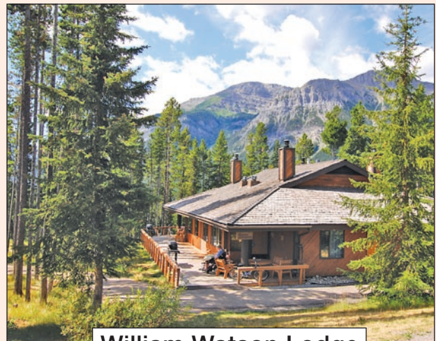
William Watson Lodge