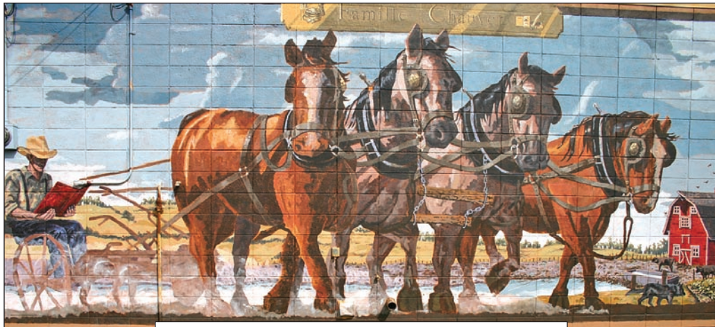
You can see many murals in Legal.