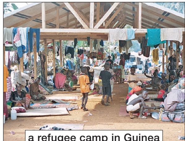
a refugee camp in Guinea