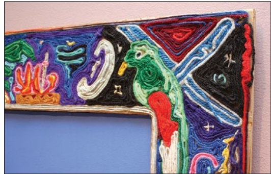
Sylvain Voyer—Solflower, 1990, acrylic on canvas with Huichol style yarn frame

Find your favourite piece of art. Look at it for 5 minutes. Why do you like it?