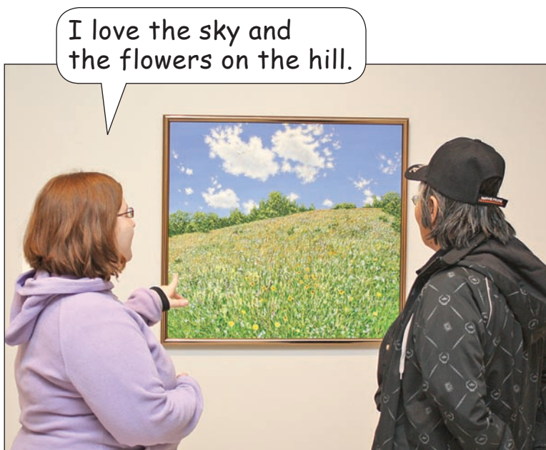
Sylvain Voyer—Untitled (hill with flowers), circa 1998, acrylic on canvas

Look at a piece of art. Do you like it? What do you see?