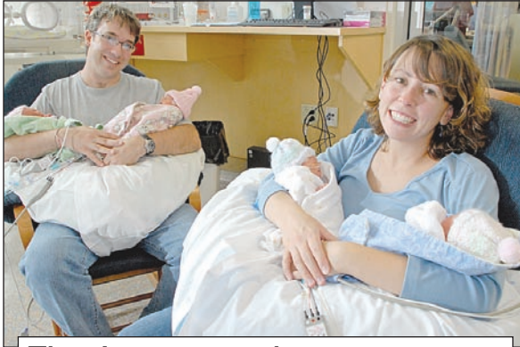
The Jepps were happy to return to Calgary with their babies.