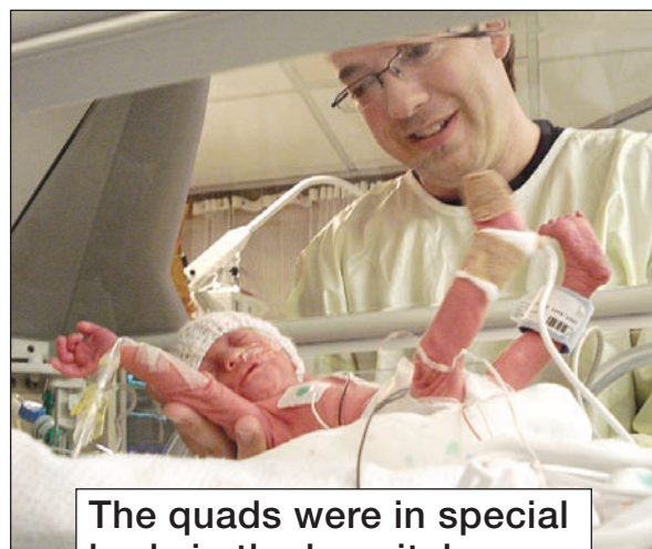
The quads were in special beds in the hospital.

The babies were in the U.S. hospital for a few days. Then they went to a hospital in Calgary.