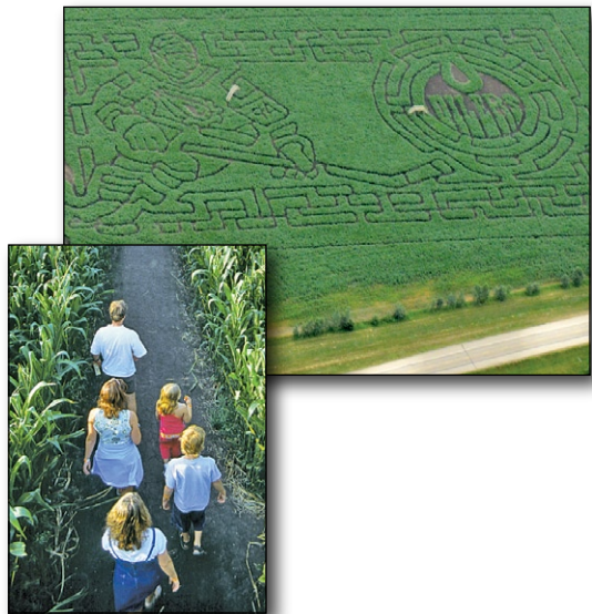
4. Walk through a corn maze.