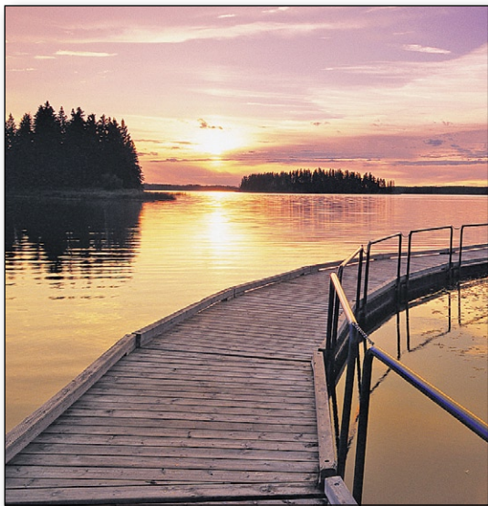
3. Watch a sunset.