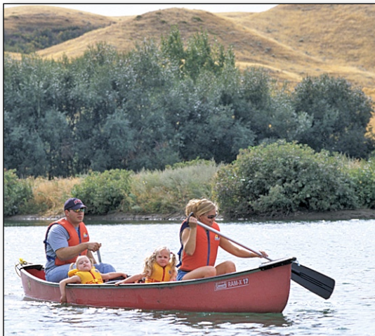
7. Rent a canoe or paddle boat.