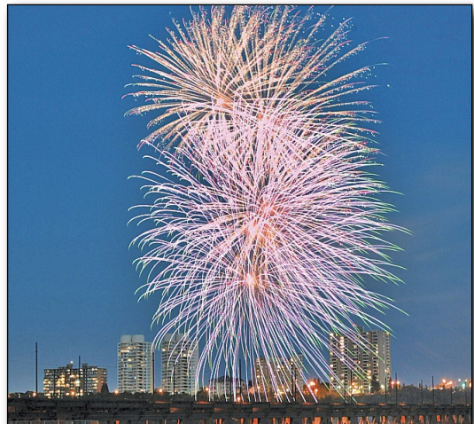
8. Watch fireworks on Canada Day, July 1.