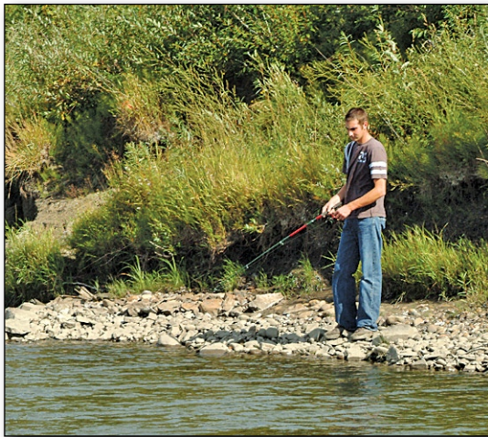
5. Go fishing.