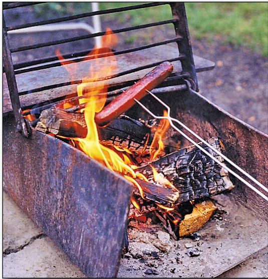
1. Cook over a campfire.