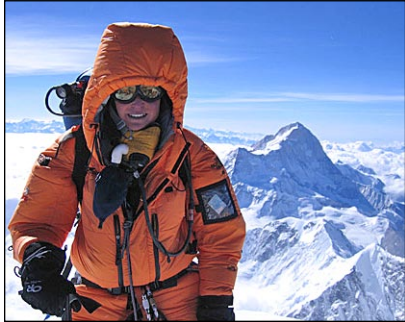
On top of Mount Everest at 8,848 metres (29,029 ft.)